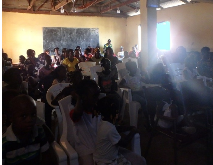
Showing the Krio version of 'The Story of Jesus for Children'

We were notified that the church was given funds to throw a New Year's party for the children but they lacked a film so we went through a few that we had to make the right choice.